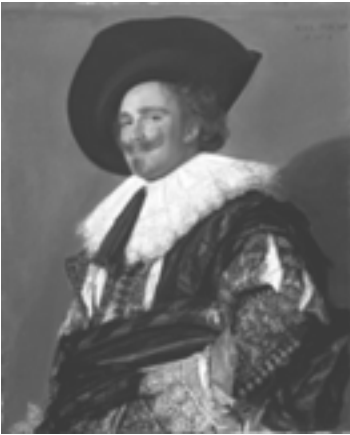
The Laughing Cavalier

music, architecture and sculpture to ballet, poetry and art, both modern and classical.