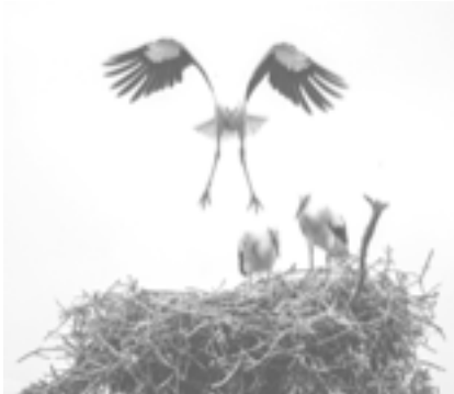
Stork's nest at Knepp

The featured film, 'Wilding', based on Isabella Tree's inspiring book about the Knepp Estate close by in Sussex, was met with rapturous applause at its conclusion. It was heartwarming to see how deeply the audience connected with the message of regeneration, rewilding and the potential for positive change.